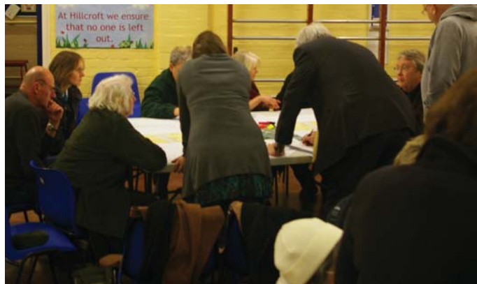
The Parish Council hosted a public meeting to explore options for re-use of the former Pinewood Garage site in Caterham on the Hill

Your Parish Council will remain vigilant on both sites; our primary objective is to encourage restoration and re-use of the Listed Buildings through acceptable new uses of the sites.