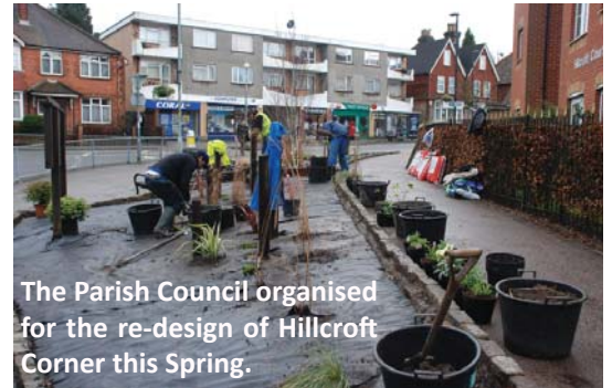
The Parish Council organised for the re-design of Hillcroft Corner this Spring.

Caterham on the Hill Parish Council has decided on no change to this year's Precept. It remains at £14.20 a year for an average (Band D) house.